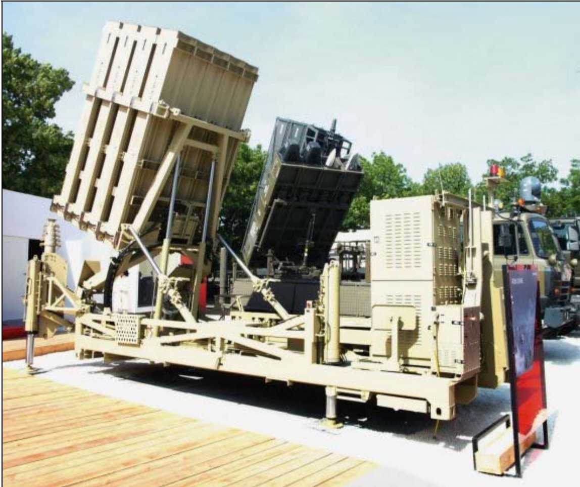
Figure 2. Iron Dome Battery